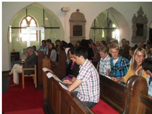
A Christian-Jewish mass in the Protestant Church of Kastellaun: Jew, Catholic, Lutheran, Charismatic, Orthodox, Atheist....