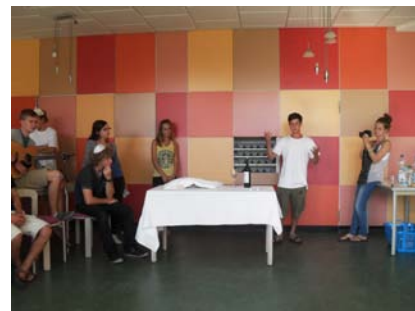
Celebrating the Shabbat in the Youth Hostel. Getting to know...